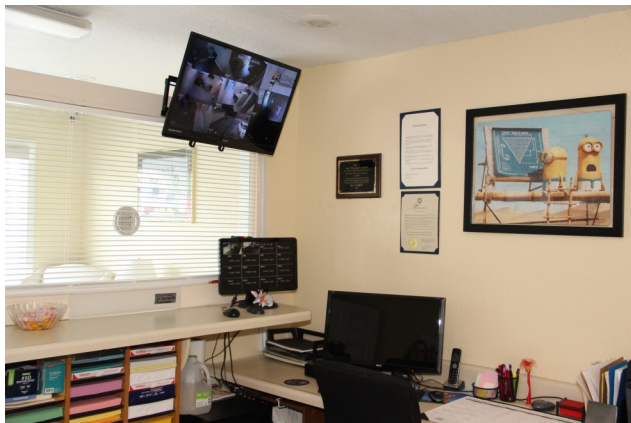
Solomon Family Solutions

Please let us know if you would like information on giving to the Endowment. Call the church office to enroll.