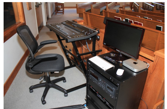
Founder's Chapel Sound System