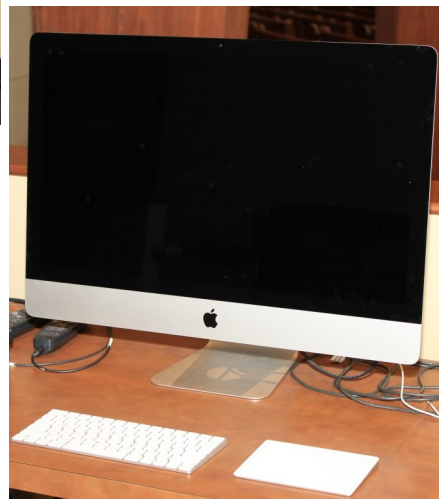
Sanctuary Media Computer