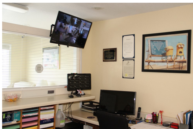
Solomon Family Solutions

Please let us know if you would like information on giving to the Endowment. Call the church office to enroll.