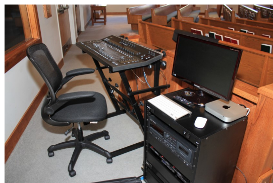
Founder's Chapel Sound System